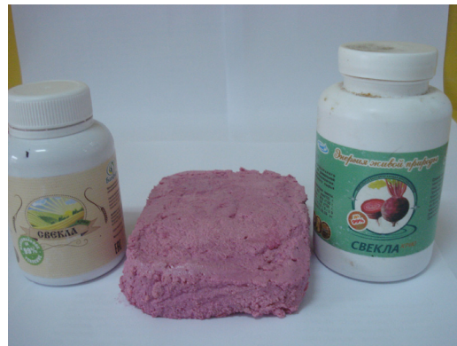
Fig. 1. Cryopowder “Beet”

determining factor in the application of the cryo-additive “Beet” was to retain the standard characteristics of sweet curd masses.